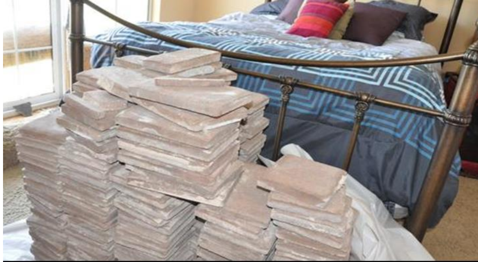
Is it normal to leave pavers at the end of a bed for over a year?