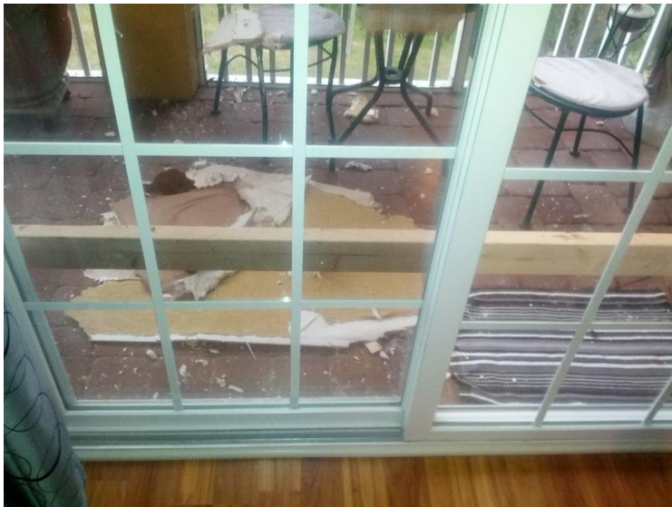
729 SPRINGHILL COURT