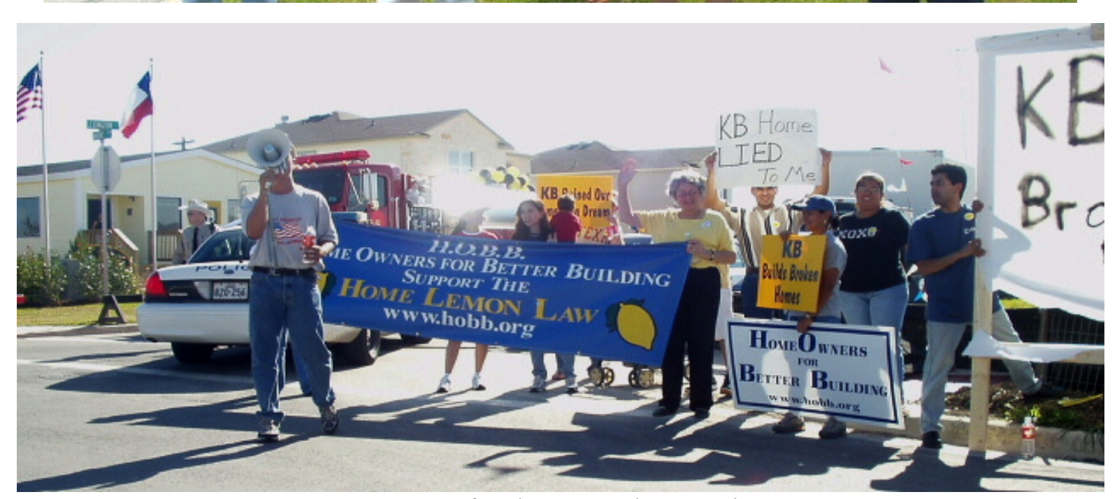
Lemons for the Day at the Capitol