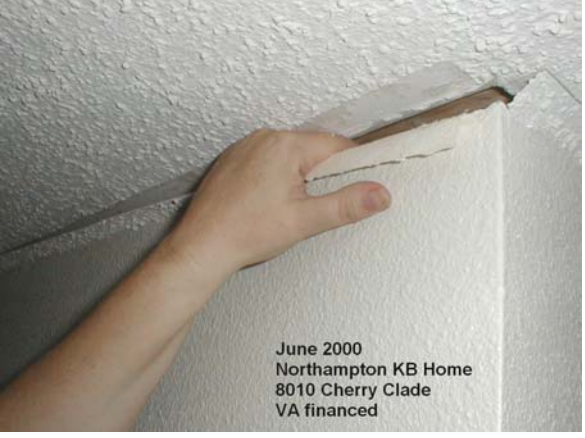
8010 CHERRY GLADE